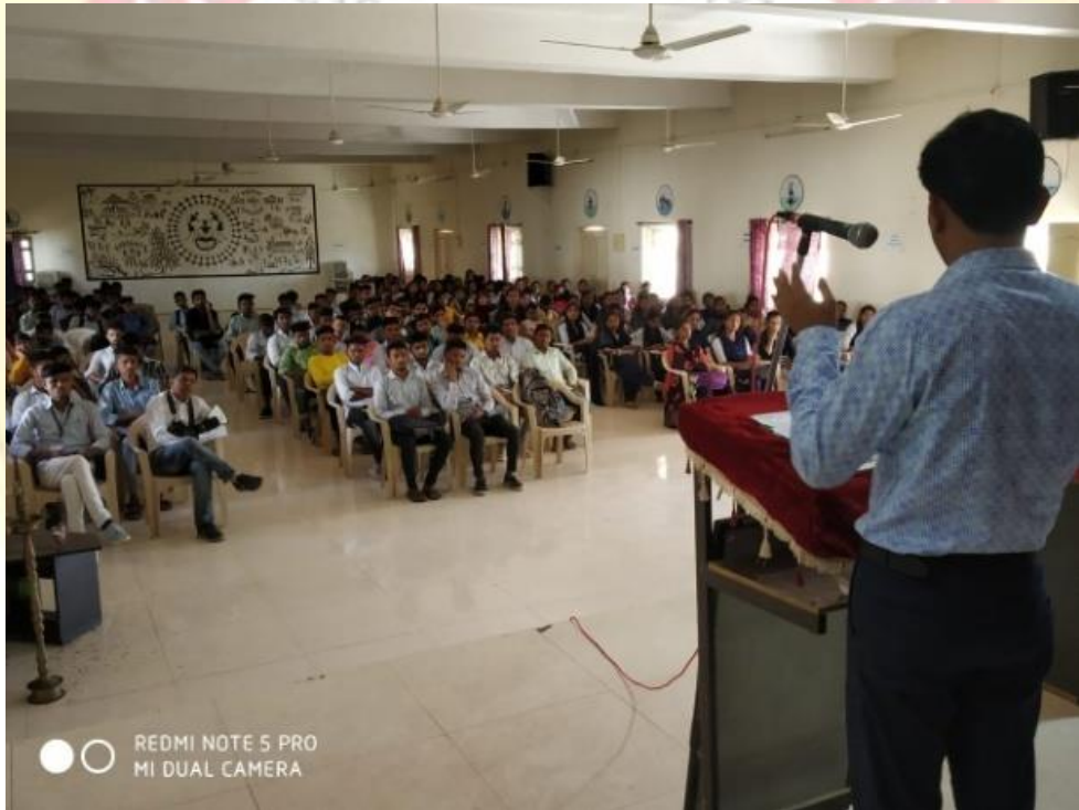
Students attending the workshop